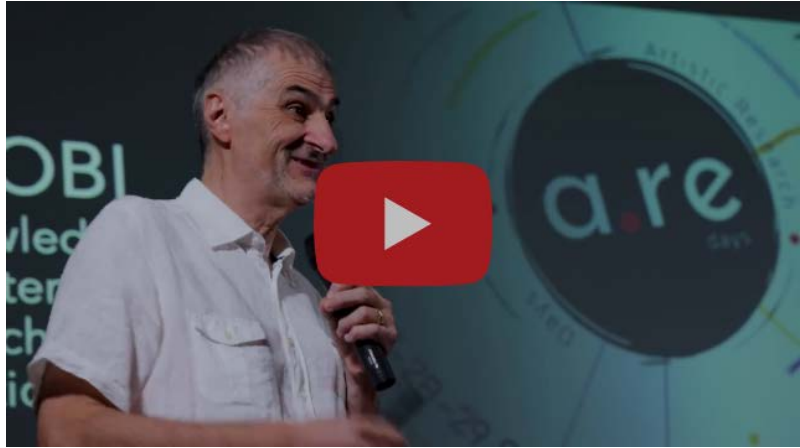
Artistic Research Days, Sept. 27-29, 2023, trailer | Video by Monkeys Video Lab

Fac ebook icon Inst agram icon Yo uTub e icon Em ail icon We bsite icon